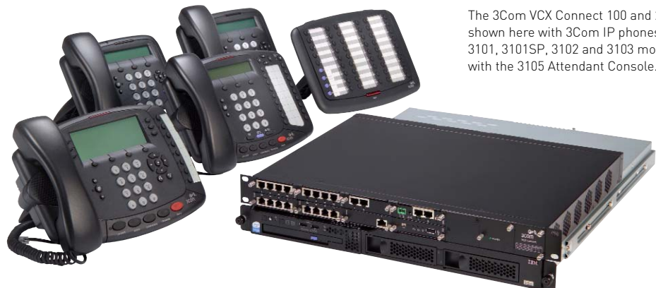
The 3Com VCX Connect 100 and 200 platform are shown here with 3Com IP phones, including the 3101, 3101SP, 3102 and 3103 models, as well as with the 3105 Attendant Console.

Standard VCX Connect features allow calls to be made using multimedia devices such as SIP-based video phones or software applications such as the 3Com Convergence Center Client that offers a rich, integrated set of communications capabilities—including instant messaging, voice, video