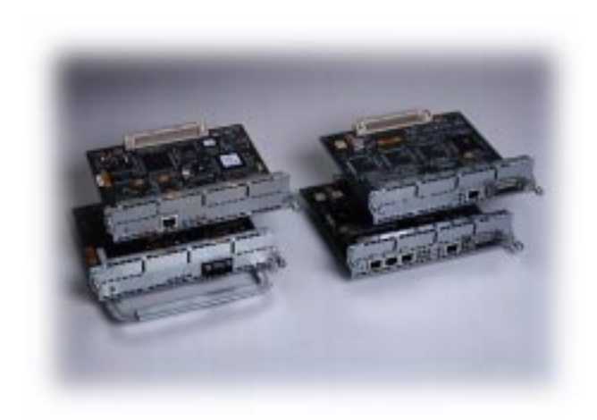
Figure 2 NM-1FE-TX, NM-1FE-FX, NM-4E, NM-1E

Ideal for a wide range of LAN applications, the Fast Ethernet network modules support many internetworking features and standards. Single port network modules offer autosensing 10/100BaseTX or 100BaseFX Ethernet. The TX version supports virtual LAN (VLAN) deployment. In customer networks, these modules may be useful for the following: