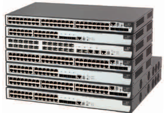
from top: 3Com Switch 5500-SI 52-Port, Switch 5500-SI 28-Port, Switch 5500-EI 28-Port FX, Switch 5500-EI 52-Port, Switch 5500-EI 28-Port, Switch 5500-EI PWR 52-Port, Switch 5500-EI PWR 28-Port

Enterprises can select Standard-Image (SI) or Enhanced-Image (EI) versions. EI models offer expanded capabilities and provide additional switching features: more MAC addresses, static routes and IP interfaces, greater number of virtual LANs (VLANs), extended port mirroring, Layer 3 OSPF routing, 3Com XRN stacking technology and IEEE 802.3af Power over Ethernet (PoE) support.