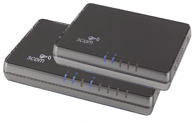
from top: 3Com Switch 5, Switch 8

Operating system independence. Supports maximum integration of different operating systems within a network—no extra configuration of the network is required.