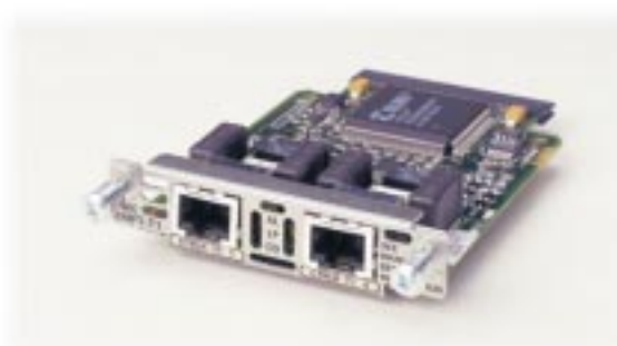
Figure 1 Cisco Dual Port T1/E1 Multiflex Voice/WAN Interface Card

VWIC-1MFT-T1, VWIC-2MFT-T1, VWIC-2MFT-T1-D1, VWIC-1MFT-E1, VWIC-2MFT-E1, VWIC-2MFT-E1-DI, VWIC-1MFT-G703, VWIC-2MFT-G703