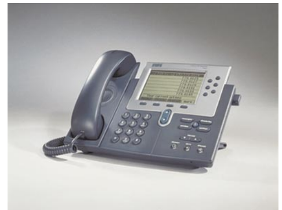
Figure 1 Cisco IP Phone 7960

digits dialed. The graphic capability of the display allows for the inclusion of present and future features.