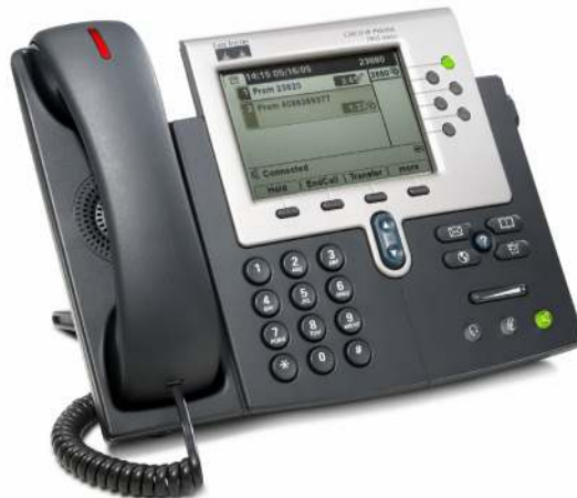
Figure 1. Cisco Unified IP Phone 7961G-GE

Providing unconstrained bandwidth to desktop applications, the Cisco Unified IP Phone 7961G-GE delivers the latest technology and advancements in Gigabit Ethernet voice-over-IP (VoIP) telephony, bringing network data and applications to users quickly with its Gigabit Ethernet port for integration with a PC or desktop server (Figure 1). “Feature identical” to the Cisco Unified IP Phone 7961G, this Gigabit Ethernet enhanced manager IP phone provides six programmable backlit line/feature buttons and four interactive soft keys that guide an executive or manager-type user through call features and functions, and audio controls for high-quality duplex speakerphone, handset, and headset. The Cisco Unified IP Phone 7961G-GE features a best-of-class large, higher-resolution, grayscale pixel-based LCD for easy access to communication information, timesaving applications, and feature usage (Figure 2). It also helps customers and developers deliver more innovative and productivity-enhancing Extensible Markup Language (XML) applications and can provide double-byte languages to the display.