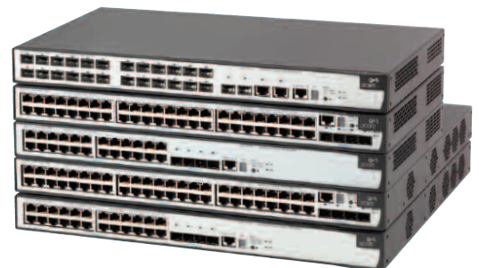
from top: 3Com Switch 5500-EI 28-Port FX, Switch 5500-EI 52-Port, Switch 5500-EI 28-Port, Switch 5500-EI PWR 52-Port, Switch 5500-EI PWR 28-Port

These switches have Enhanced-Image (EI) software, which offers Enterprise-class switching features including more MAC addresses, static routes and IP interfaces, greater number of virtual LANs (VLANs), extended port mirroring, Layer 3 OSPF and multicast routing, enhanced resiliency via 3Com XRN stacking technology and IEEE 802.3af Power over Ethernet (PoE) support.