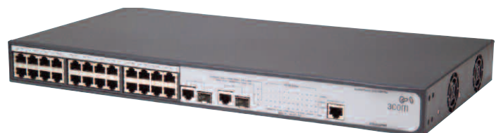
3Com Baseline Switch 2426-PWR Plus

This Baseline Plus switch is operational straight out-of-the-box; as long as default settings are acceptable, there is no need to configure the switch. If desired, the switch can be configured using a web browser or SNMP management software.