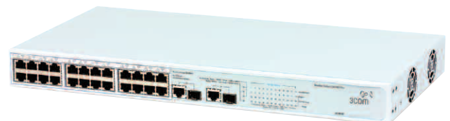
3Com Baseline Switch 2426-PWR Plus

This Baseline Plus switch is operational straight out-of-the-box; as long as default settings are acceptable, there is no need to configure the switch. If desired, the switch can be configured using a web browser or SNMP management software.